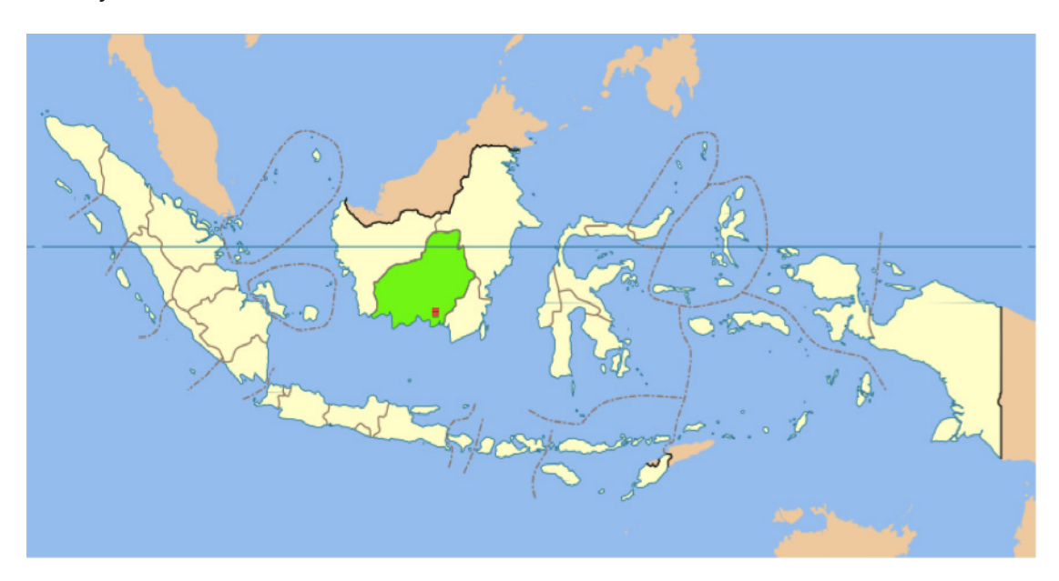
Figure 1: Map of Indonesia with provincial borders and boundaries of neighbouring countries. Central Kalimantan is highlighted, with Sebangau National Park highlighted in red. (Source: Wikipedia.org ).

1985 and 2002 Kalimantan lost over 13 million hectares, i.e. 34% of its forests<sup>2</sup>. This has had huge implications on an international, national and local scale for carbon dynamics, biodiversity conservation, and local livelihoods<sup>3</sup>.