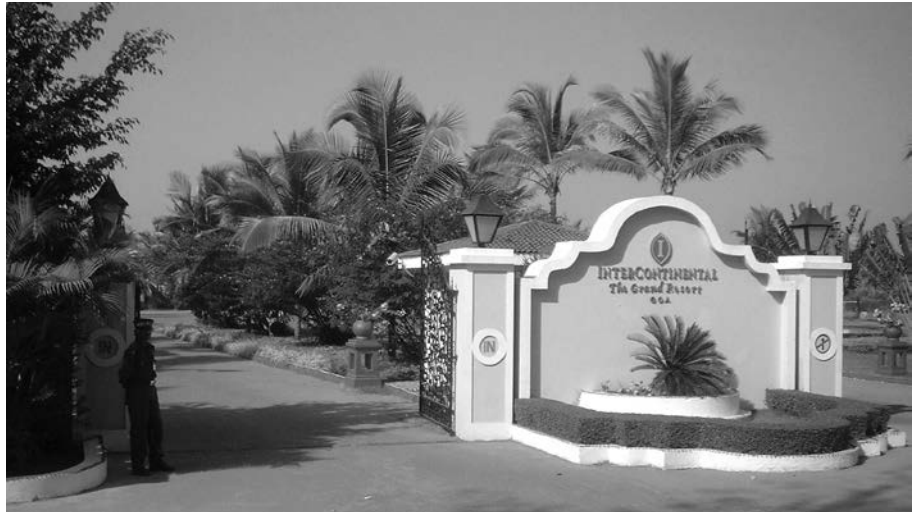
Plate 6: The InterContinental Hotel, Goa, India