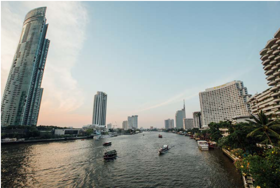
Figure 7.2: Chao Phraya River

Together with many other tangible and intangible elements, the small businesses of West Bang Rak are what make it a diverse and creative district. 'Mom and pop' stores and boutiques dominate the area, with few chain stores. Restaurant owners and street food vendors serve their signature dishes to regular customers throughout the day. Gallery owners showcase exhibits and serve niche clients interested in certain styles and types of artwork. Deeper in the side streets, design shops sell specialised products and services that complement each other. In the evenings, bars with unique themes and characteristics receive guests, both from within the area and elsewhere.