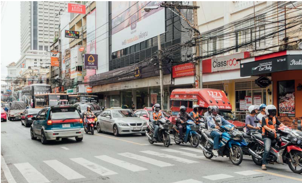
Figure 7.3: Traffic conditions in the district

The neighbourhood's layout and state of its street network does not encourage mobility. West Bang Rak has just one arterial road, Charoenkrung Road, and the small street offshoots are not linked with one another. This is a legacy of the city's early ribbon development, which has led to poor traffic flow, encouraged sprawl and created isolated blocks. Charoenkrung Road is considered narrow for a main road and is often congested during rush hour.