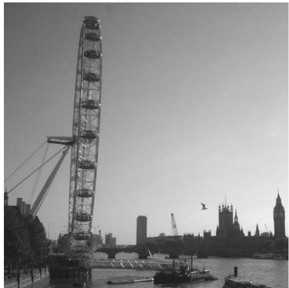
Plate 8: The Coca Cola London Eye