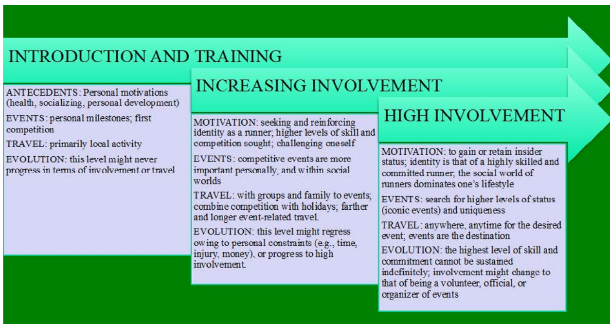
Hypothetical event travel career trajectory for amateur distance runners

The diagram below includes major changes in motivation, the events attended, travel style and evolutionary considerations for the travel career trajectory. There is a growing body of literature on this "theory in development" but for evaluators it presents a challenge: at what stage are participants at? Does the event cater to the highly involved or beginners?